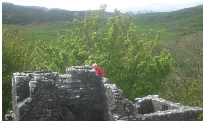
Some folk headed for the top...