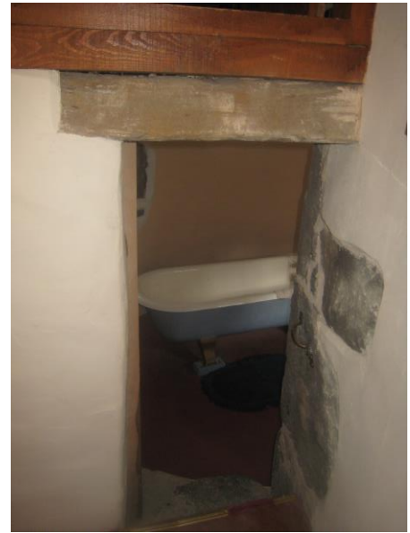
All mod cons – a bathroom in Kilmartin Castle