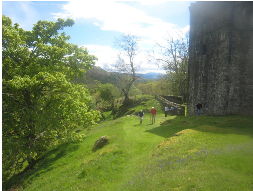
The stunning location of Carnasserie Castle