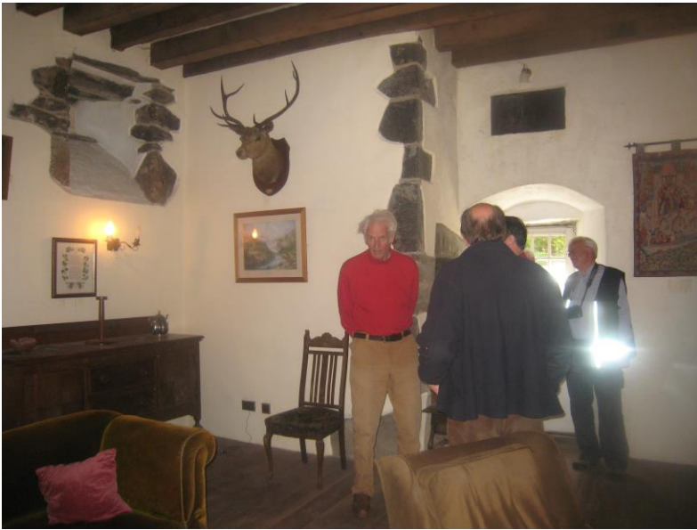
The main sitting room, Kilmartin castle